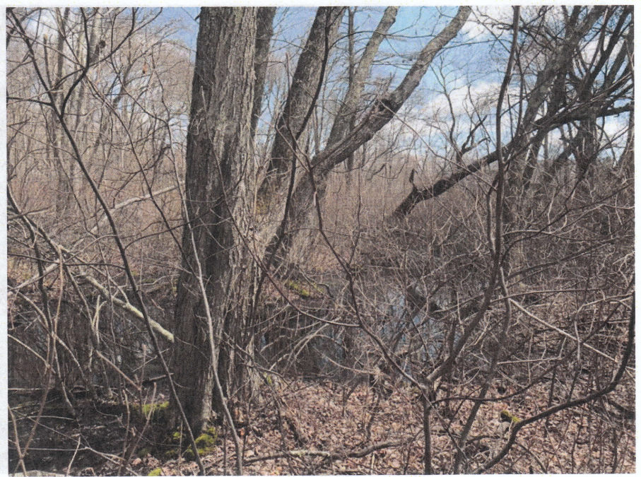
Photo 12 Looking N along lot boundary from photo point 12 Narragansett, Rhode Island, 18 April 2018