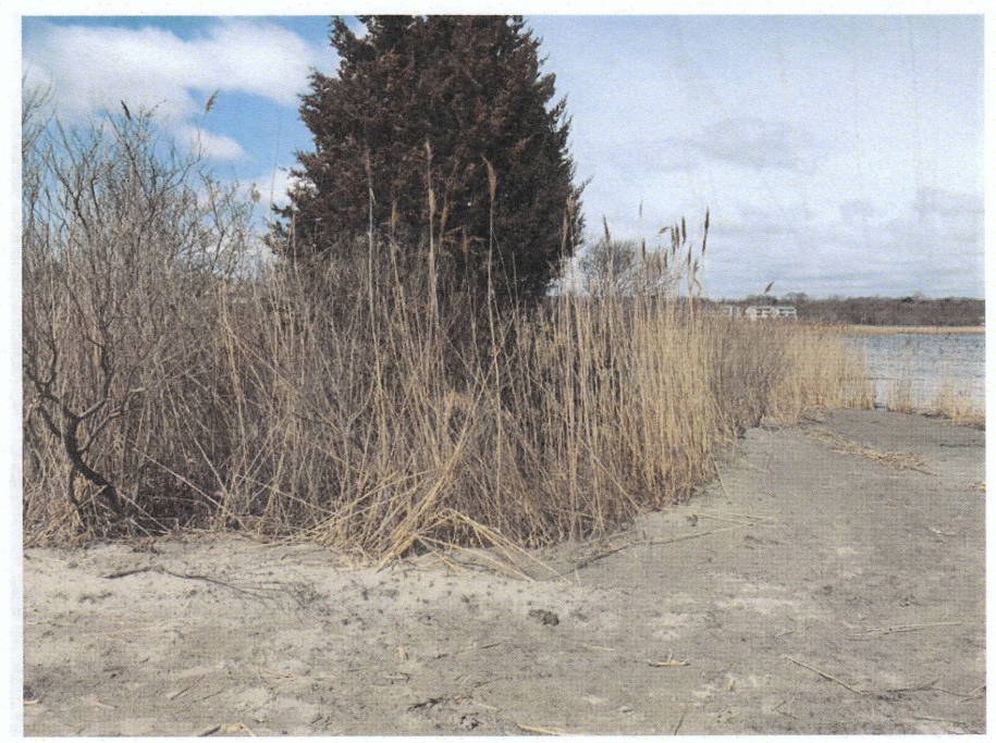
Photo 6A Looking W along S boundary from photo point 6 Narragansett, Rhode Island, 18 April 2018