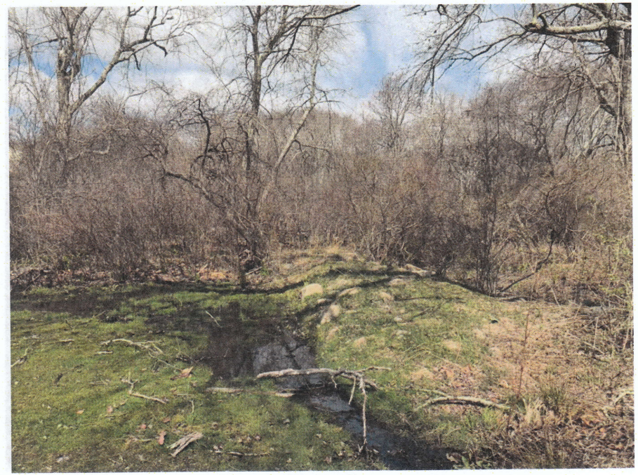
Photo 7 Looking NW at lot from photo point 7 Narragansett, Rhode Island, 18 April 2018