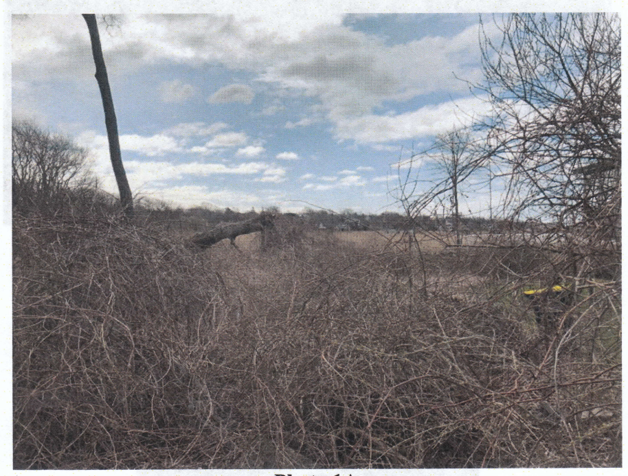
Photo 1A Looking SE along lot boundary from photo point 1 Narragansett, Rhode Island, 18 April 2018

Photographs Wesquage Pond Narragansett, Rhode Island