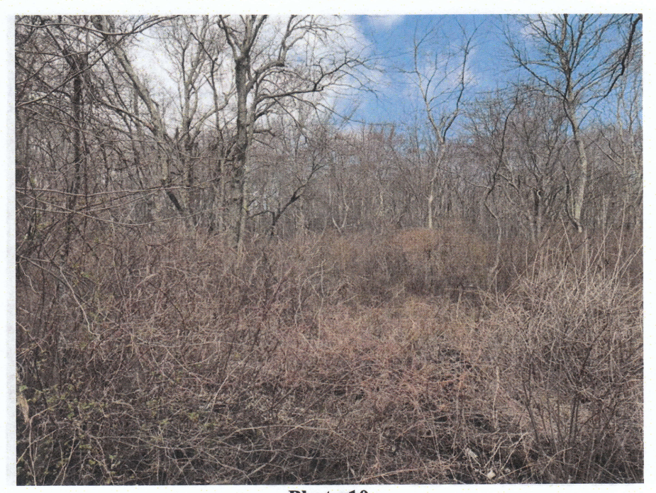
Photo 10 Looking NW at lot from photo point 10 Narragansett, Rhode Island, 18 April 2018