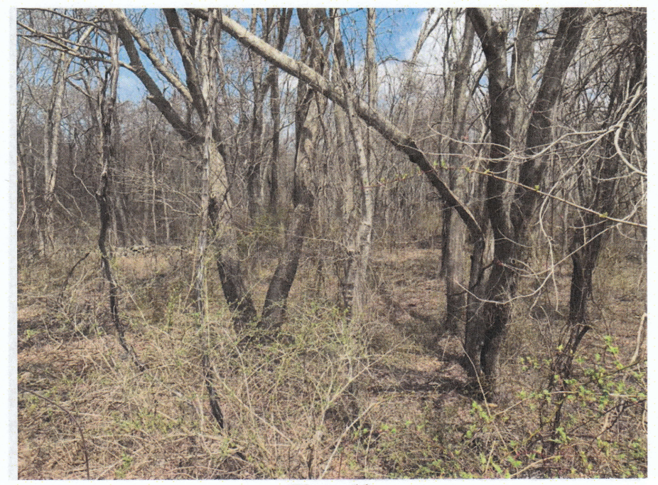
Photo 13 Looking NE into lot from photo point 13 Narragansett, Rhode Island, 18 April 2018