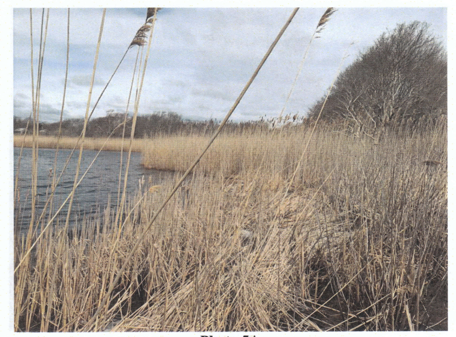
Photo 5A Looking N along lot boundary/pond from photo point 5 Narragansett, Rhode Island, 18 April 2018