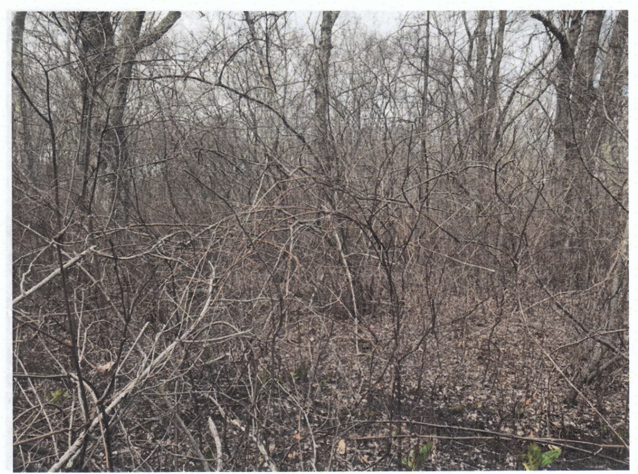
Photo 11 Looking E into lot from photo point 11 Narragansett, Rhode Island, 18 April 2018