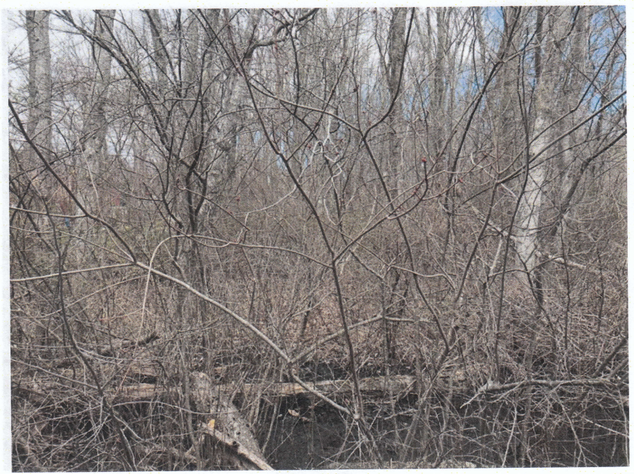
Photo 8 Looking NNW into lot from photo point 8 Narragansett, Rhode Island, 18 April 2018