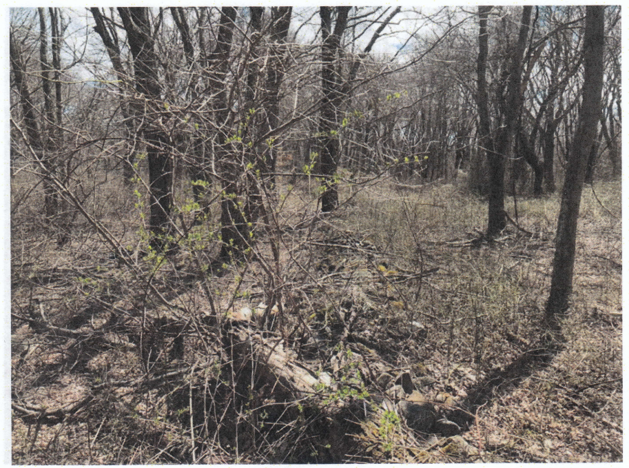
Photo 15A Looking S along lot boundary/stone wall from photo point 15 Photographed by Kyle R. Hess Narragansett, Rhode Island, 18 April 2018