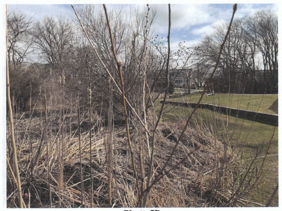
Photo 5B Looking E along lot boundary from photo point 5 Narragansett, Rhode Island, 18 April 2018