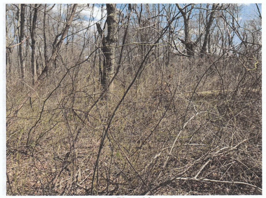
Photo 16 Looking E into lot from photo point 16/E most accessible point in lot Photographed by Kyle R. Hess Narragansett, Rhode Island, 18 April 2018

Warms fot boundary/stone wall from photo point I Nurtographed by Kyle R. Hess Narraganset, Rhode Jalaid, 18 April 2018