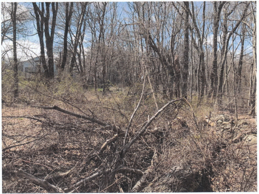
Photo 15B Looking W along lot boundary/stone wall from photo point 15 Narragansett, Rhode Island, 18 April 2018