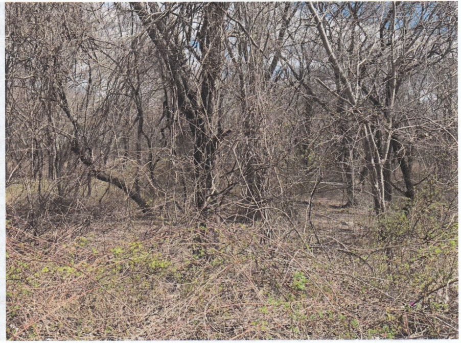
Photo 14 Looking E into lot from photo point 14 Narragansett, Rhode Island, 18 April 2018