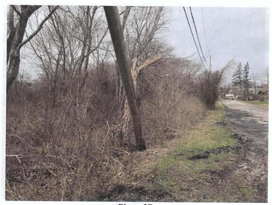
Photo 3B Looking W along lot boundary/Lake Road from photo point 3 Narragansett, Rhode Island, 18 April 2018