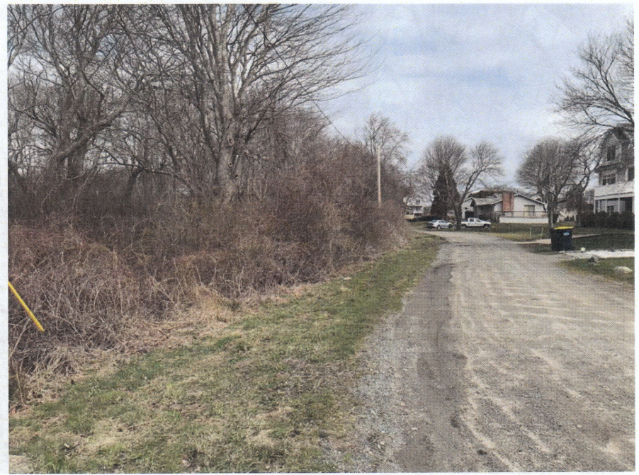
Photo 4B Looking N along lot boundary/Wolfe Road from photo point 4 Narragansett, Rhode Island, 18 April 2018