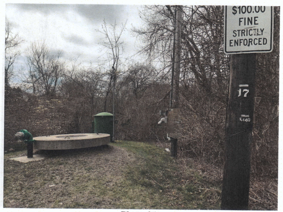
Photo 3A Looking SSE along lot boundary from photo point 3 Narragansett, Rhode Island, 18 April 2018