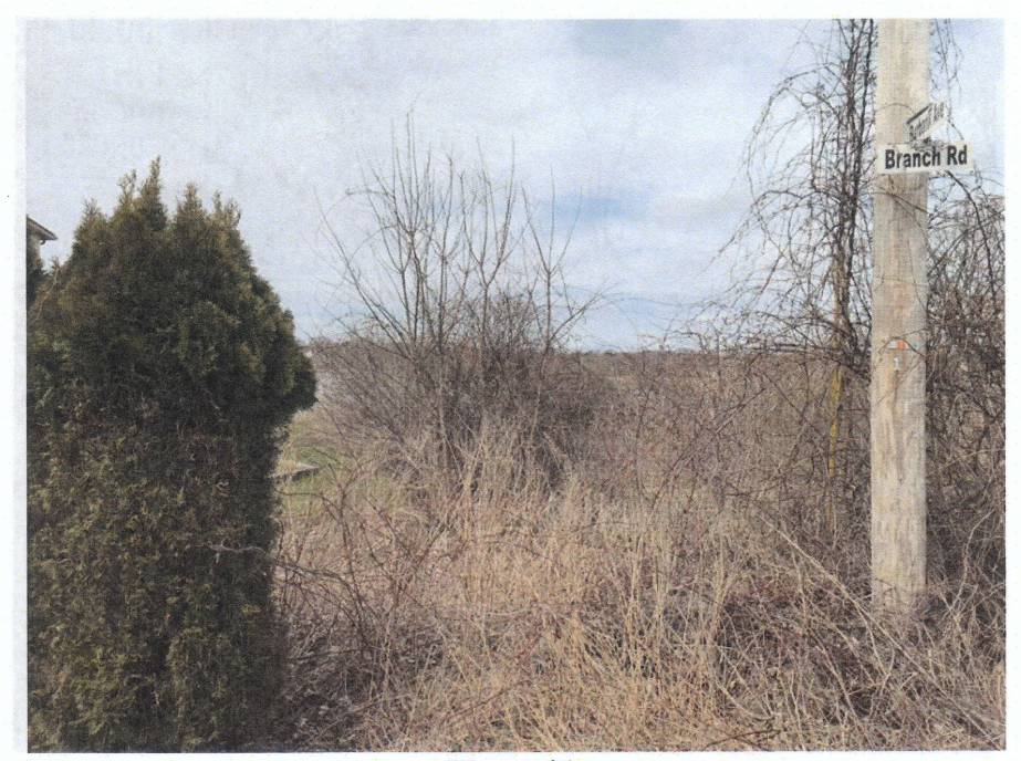
Photo 4A Looking W along lot boundary from photo point 4 Narragansett, Rhode Island, 18 April 2018