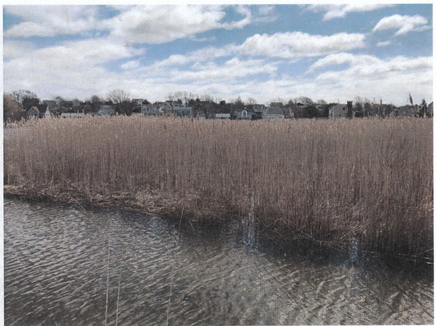
Photo 6B Looking E along S boundary from photo point 6 Photographed by Kyle R. Hess Narragansett, Rhode Island, 18 April 2018