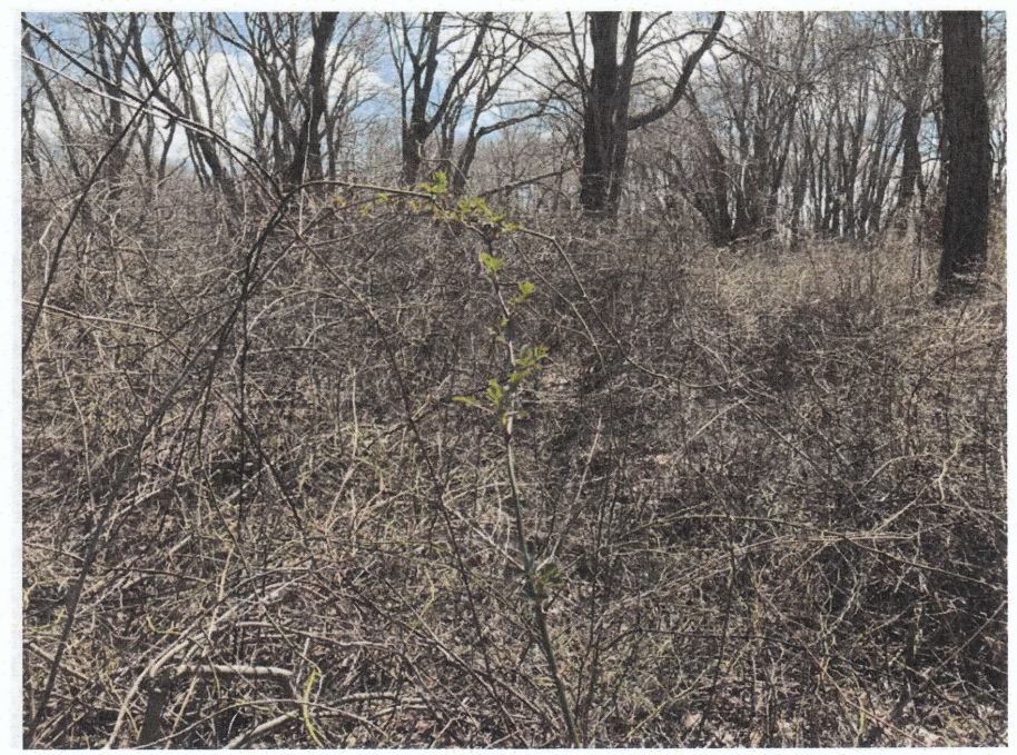
Photo 9 Looking N at lot from photo point 9 Narragansett, Rhode Island, 18 April 2018