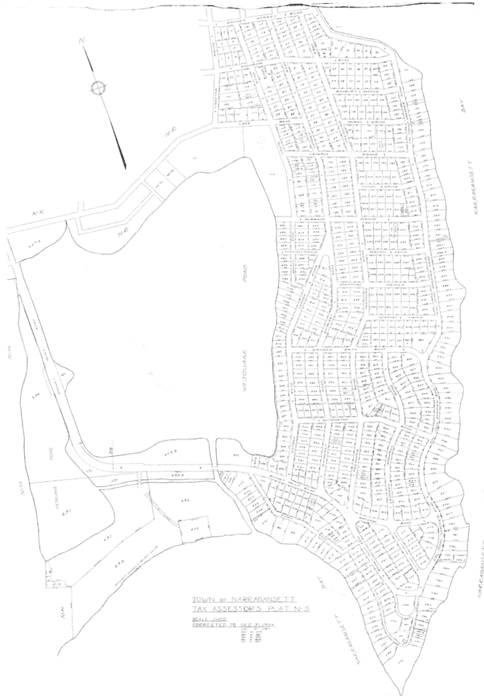
Figure 1B Town of Narragansett Tax Assessor's Map Plat N-S Wesquage Pond